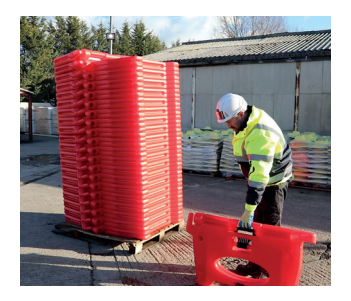
Bend your knees and carefully lower the barrier to the ground.