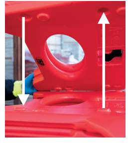
When placing the barriers on top of each other, the design allows a barrier to interlock into another to ensure a safe and secure stacking system.