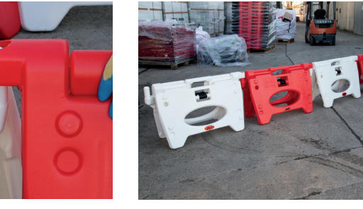
The acute angled barrier design allows for multiple configurations on both flat and uneven surfaces.