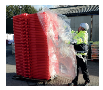
Pull the plastic wrap while moving around the pallet to remove.