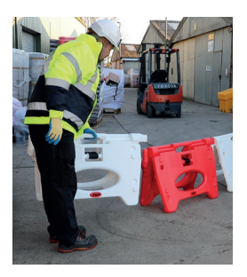
To link multiple barriers together, place the end of the barrier that has an aperture over the up-stand on the end of the next barrier.