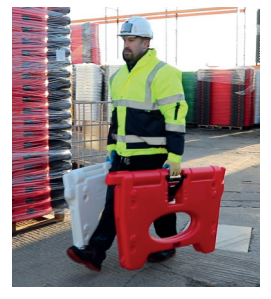
The convenient carry handle and lightweight design allows two barriers to be carried at the same time.