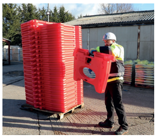
Hold on to the carry handle found at the top of the AlphaBloc®. This can be done with one hand due to the lightweight design.