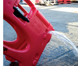
To empty, lift the end of the barrier furthest from the filling aperture and rest on the ground until the water ceases to flow.