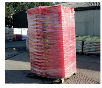
AlphaBloc® Space Saver barriers are supplied on pallets. They are shrink wrapped in plastic and secured with plastic banding straps.