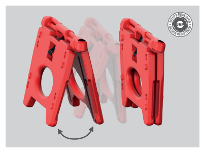
The uniquely foldable design allows for quick and easy deployment of the barrier.