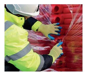
The plastic wrap is easily removed by carefully running a knife through the shrink wrap material.